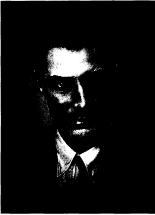
FIGURE 1 Oppenheimer as Wartime Director of the Los Alamos Laboratory