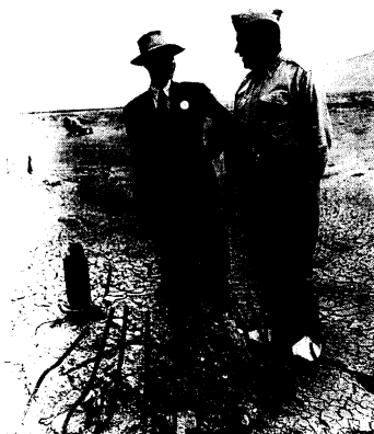
FIGURE 5 Contrasting Personalities

Oppenheimer and Groves are shown revisiting the site of the Trinity atomic bomb test at Alamogordo, NM. In front of them is what remained of the tower on which the bomb was mounted.