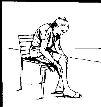
Fig 1.—Patient education material designed to reduce patient demand for vasodilators for claudication. Space for an "exercise prescription" is provided inside.

constraints in busy office practices, and economic incentives as prerequisites to the design of educational messages. 5,23-26