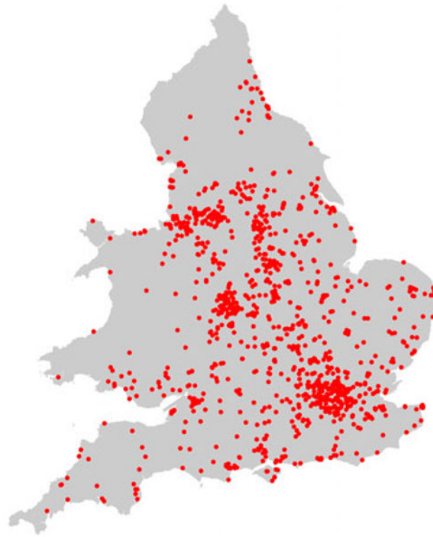
Figure 1. Location of families in the E-Risk study who were living in England and Wales and participated in Phase 12 assessment ( n = 1,071 )