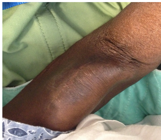
Figure 1 Picture of arteriovenous fistula site following thrombotic occlusion for patient in case 1.

The patient was given her home dose of carvedilol and shortly thereafter developed bradycardia with a heart rate of 28 bpm and transient hypotension with a systolic blood pressure of 68/32 mm Hg. Electrocardiogram revealed a junctional rhythm. Intravenous atropine was administered with transient improvement in heart rate (Figure 2A). The