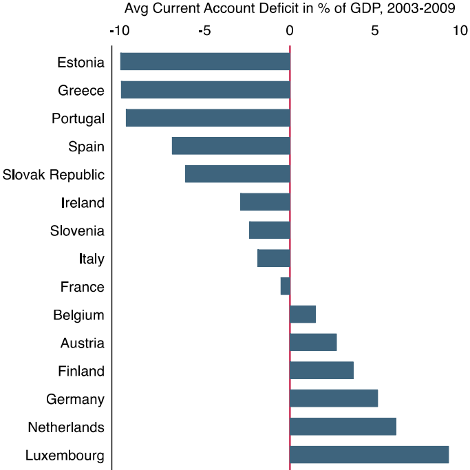
Figure 1: Average Current Account Deficits in the Eurozone, 2003-09