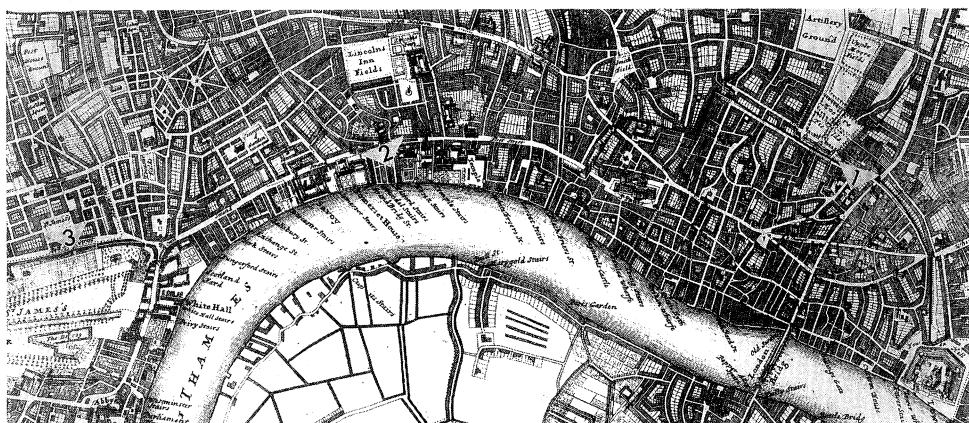
Figure 4. Detail from a map of London in the early eighteenth century, by John Styrpe, showing the relative locations of Gresham College (1), Arundel House (2), and Boyle's house and laboratory in Pall Mall (3). From John Stow, A Survey of the Cities of London and Westminster (London, 1720); courtesy of Special Collections, University of Edinburgh Library.

confirmation of his hypothesis of the air's spring.) Huygens had produced the alleged phenomenon in Holland, and Boyle disputed its status as an authentic fact of nature by suggesting that nondescent was due to the leakage of external air into Huygens's pump. Hooke was directed to prepare the experiment for the Royal Society. During the early phases of the career of anomalous suspension in England, the experimental leaders of the Royal Society were of the opinion that no such phenomenon legitimately existed. Any experiment that showed it was considered to have been incompetently performed—the apparatus leaked. Since members of the society had considerable experience of Hooke's bringing them experiments in pumps that were not "sufficiently tight," they readily concluded that Hooke's first productions of anomalous suspension were instances of experimental failure. 86 The experimental phenomena had not been made sufficiently docile. Hooke had indeed tried the experiment at home and had deemed it ready to be shown. The leaders of the society concluded otherwise: Hooke had produced only a trial, a failed show. What Hooke claimed to be knowledge, the society rejected as artifact. They disputed his claim by stipulating that the thing was not proper to be shown in a public place. 87