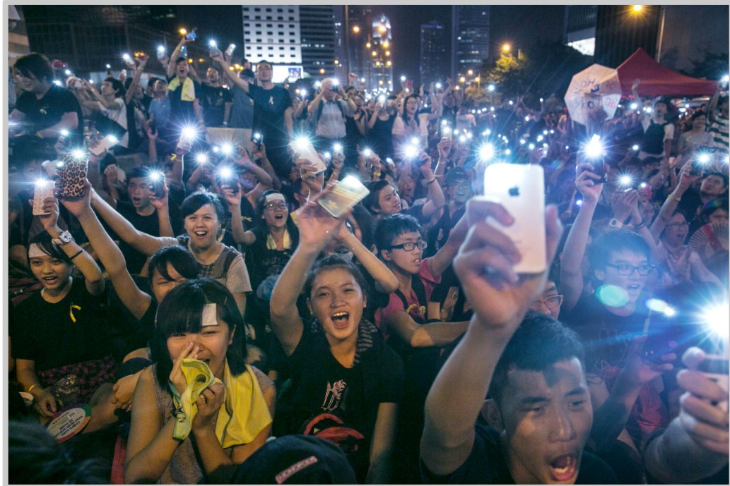
Figure 2. This photo from the 2014 pro-democracy movement in Hong Kong illustrates the interplay between technology and political aspirations.

There are also equilibrium (or perhaps meta-stable equilibrium?) nation-states that routinely limit their citizen's access to information. A particularly dynamic situation at present is the Islamic Republic of Iran, which recently established a Supreme Council for Cyberspace [10], while simultaneously slightly relaxing the restrictions placed on social media access. In the framework of Figure 1, this is an attempt by the government to retain equilibrium (and power) by addressing the changing expectations among its populace with adjustments in its technology policy. China also exerts a tight control over information access by and between its citizens. Web sites are blacklisted by the tens of thousands [11], and as many as 16% of the postings on social media sites are deleted by censors [12].