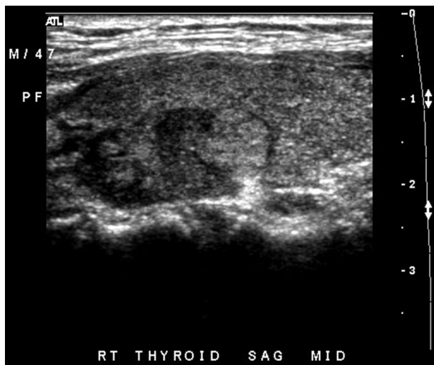
Fig. 3. Thyroid ultrasound demonstrating a 1.4 \times 1.5 \times 2 cm heterogenous nodule with internal calcifications in the right thyroid lobe.

showed a 1.6 cm infiltrative FVPTC with focal extrathyroidal extension and vascular invasion (Fig. 4). There were no regional lymph node metastases. Despite aggressive treatment that included suppressive thyroid hormone treatment to non-detectable TSH levels, repeated courses of radioiodine treatment, external beam radiation of the iliac bone metastasis, and treatment with the kinase inhibitor sorafenib, the disease progressed with growth of the iliac/pelvic mass and additional metastatic spread to cervical and lumbar vertebrae causing worsening pain and disability. Four years after his presentation, the patient, now terminally ill, returned to his homeland to spend time with his family. It should be noted that the patient described here was among a group of 179 patients with FVPTC that we reported recently [3]. Although the patient was mentioned in that report, detailed descriptions of histopathological and imaging findings and gene sequencing were not included in our previous study.