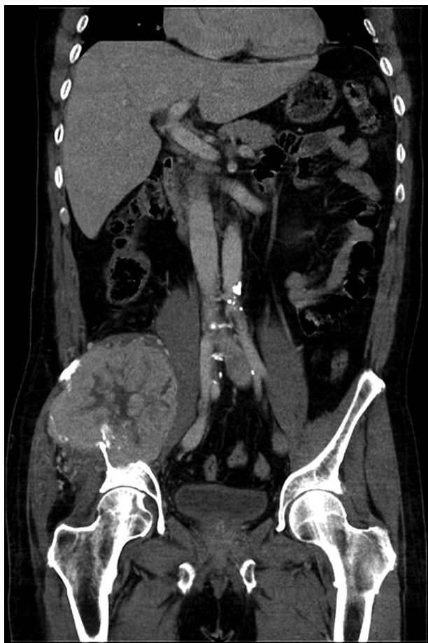
Fig. 1. Abdominal/pelvic CT obtained when the patient presented to the ER with right hip pain.

an absolute correlation between gene mutations and the clinical behavior of thyroid neoplasms [13–15].