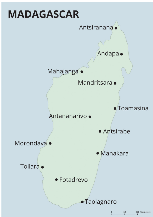
Figure 1 Map of Madagascar showing location of cities used in centralised and decentralised selection strategies.

other barriers still exist, such as distance, transport costs and health literacy. Deliberate patient selection strategies aimed to target the financially poor, those living in remote areas and to overcome gender disparities are needed, but it is unclear whether such strategies are sufficient to overcome these barriers.