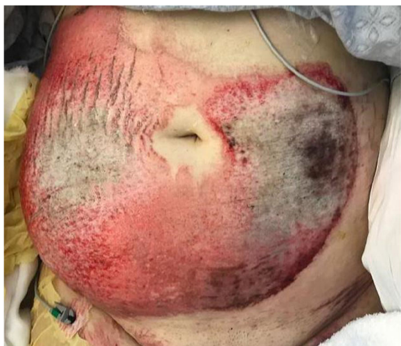
Fig. 1 Initial evaluation of mixed friction burn to anterior abdomen of a 30-year old female pedestrian struck by a motor vehicle. Total burn surface area (TBSA) estimated to be 13% (4% full-thickness 3rd degree, 9% partial thickness 2nd degree)