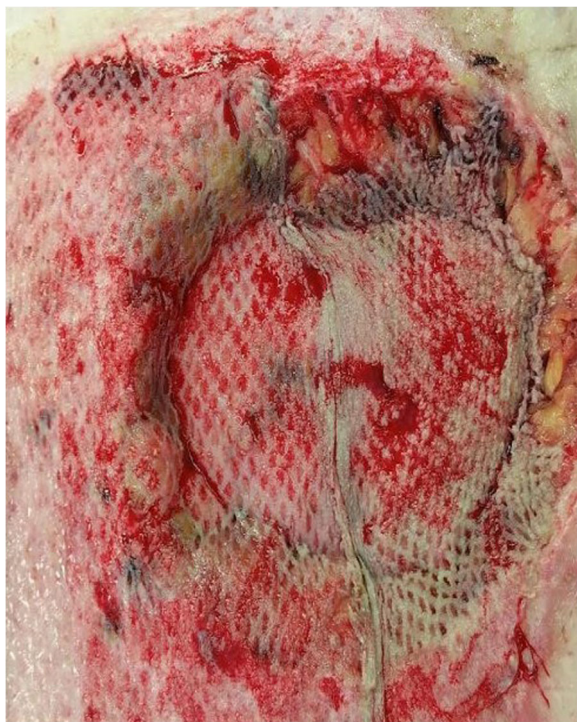
Fig. 3 Post-repair day 5 of abdominal wall Morel-Lavallee lesion with excision and autografting with split-thickness skin graft of a 30-year old female pedestrian struck by a motor vehicle