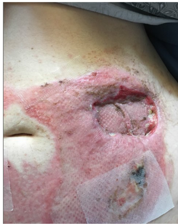
Fig. 4 Post-repair week 5 of abdominal wall Morel-Lavallee lesion with overlying burn injury of a 30-year old female pedestrian struck by a motor vehicle. Successful take of split thickness skin graft

declaration of ischemia. If the skin and/or subcutaneous tissues are traumatically separated from the overlying fascia (MLL), as in the case presented here, perfusion to the overlying skin is further compromised from transection or thrombosis of perforators, thus creating a more complex soft tissue injury.