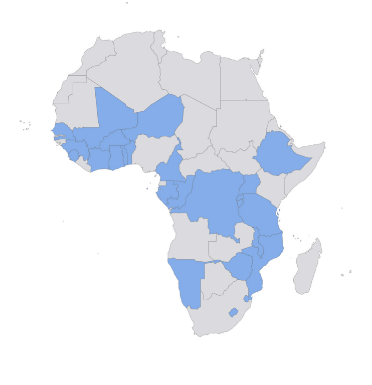
Figure 1 Map of 27 sub-Saharan African countries included in analysis.

We included data from children age 6–59 months in the 27 SSA countries participating in the DHS that performed anaemia testing (see figures 1 and 2). We analysed the Children's Recode using data from the most recent surveys available (2008–2014). In most cases, we used data from DHS-VI; for Ghana we used data from DHS-VII; for Sao Tome and Principe and Swaziland we used data from DHS-V. Madagascar was excluded from the analysis because of missing data on children's weight.