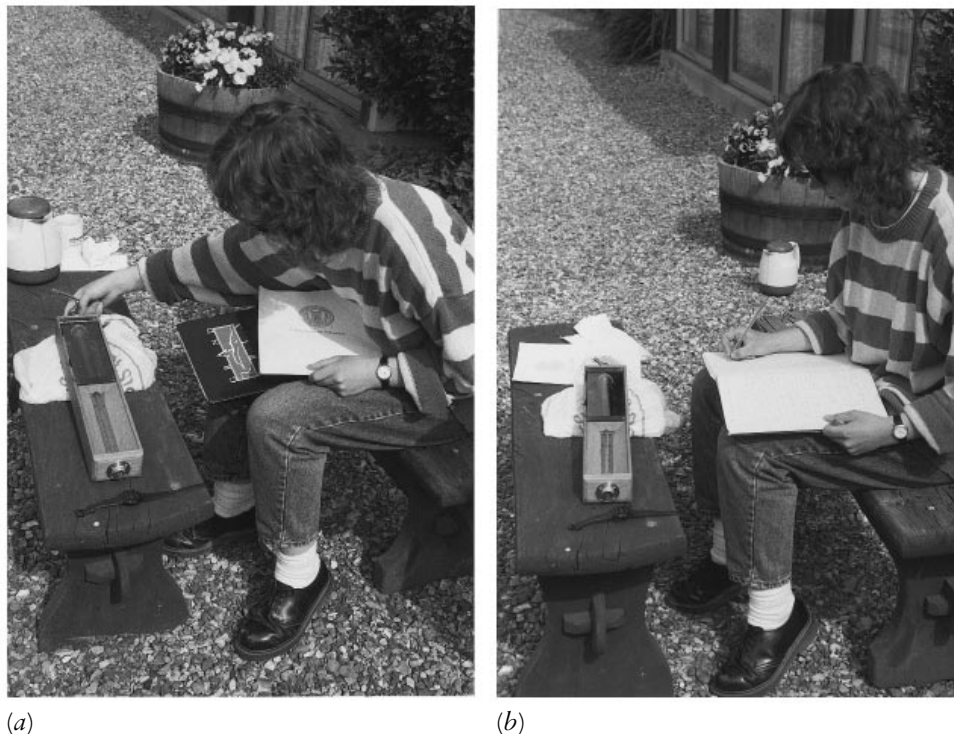
Figure 2. The author as part of the experimental process. (a) Readjusting the screw while measuring sunshine. (b) The activity of reconstructing practical data as a set of notes.

I solve the seal problem by leaving a remnant of air in the cylinder and driving it up to the bottom part of the cylinder, next to the screw device. There, the air does not disturb the liquid's transition from the cylinder into the thermometer tube. Thus, I find a way of bypassing the instructions and work out a routine that enables me to avoid the messy affair of the seal. This routine allows me to cushion the first technical problem.