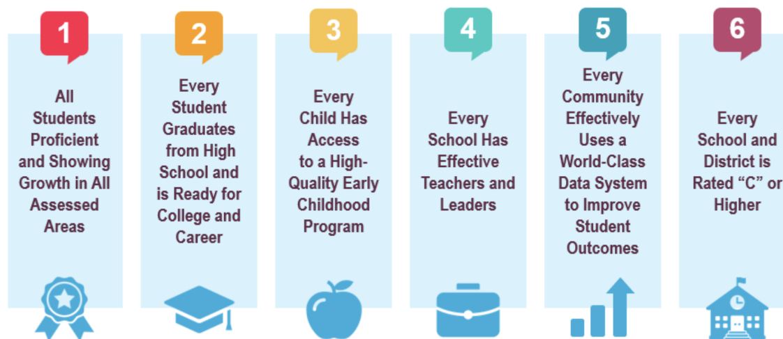
Figure 1. State board of education goals. From 2019 Strategic Plan Status Update , by the Mississippi Department of Education, 2019, https://www.mdek12.org/sites/default/files/Offices/MDE/SSE/2019_strategic_plan_status_update_web.pdf .

The Mississippi Department of Education (MDE) administers policy and performance systems to support the leadership and learning of Mississippi's approximately 466,000 public school students. The MDE's vision is "to create a world-class educational system that gives students the knowledge and skills to be successful in college and the workforce, and to flourish as parents and citizens" ("Mississippi Board of Education Strategic Plan," 2018). In pursuit of this vision, the Mississippi State Board of Education outlined the following six strategic goals for 2016-2020.