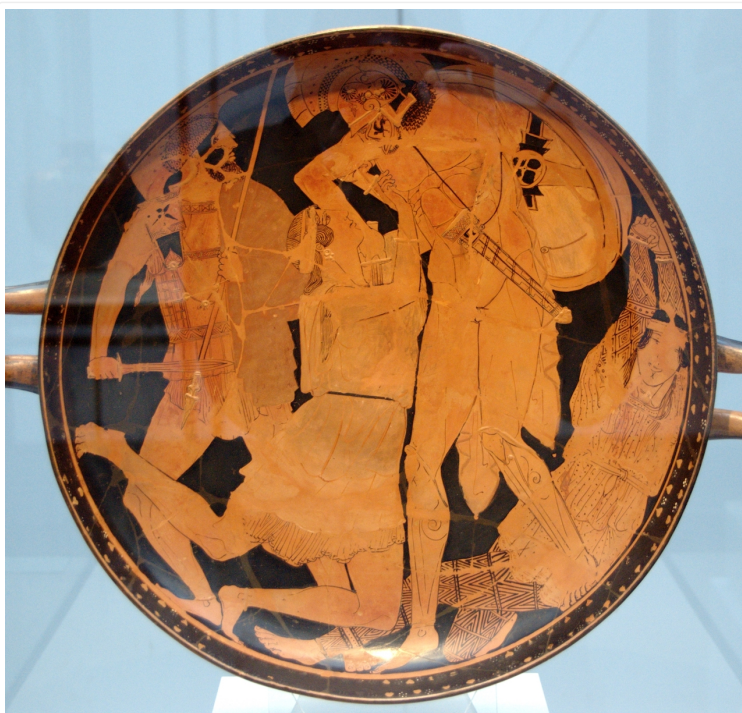
Achilles killing Penthesileia. Red-figure kylix, 5th century BCE. Munich, Staatliche Antikensammlungen. Image via Wikimedia Commons.