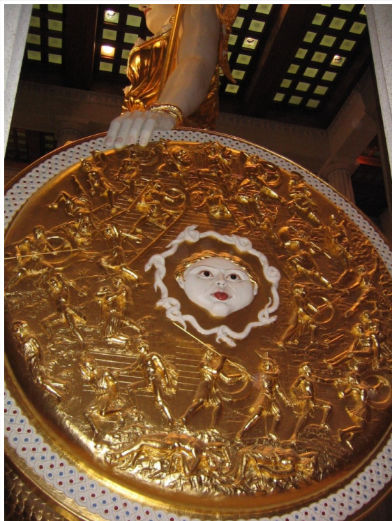
Shield of Athena Parthenos, Nashville Parthenon, Tennessee.