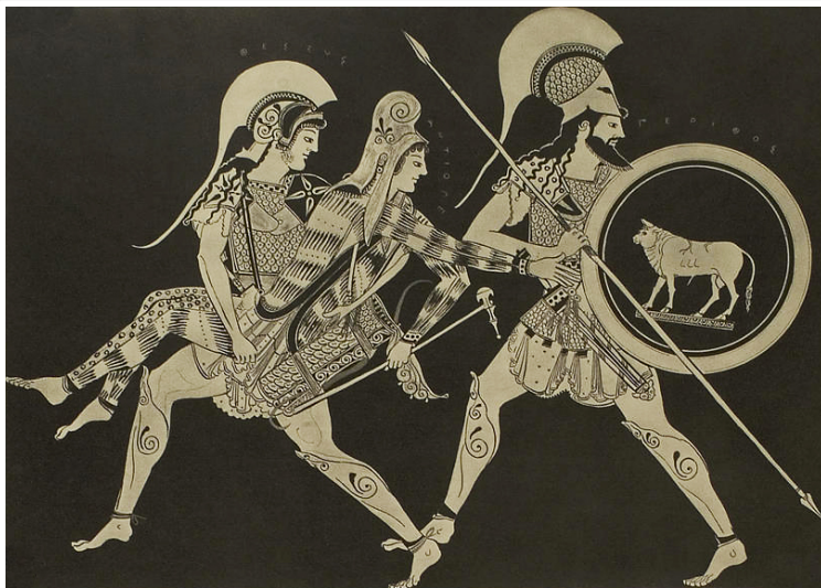
Abduction of Antiope by Theseus, with help from Peirithoös (all named in inscriptions). Red-figure amphora by Myson, ca. 500 BCE. Paris, Musée du Louvre, G197.