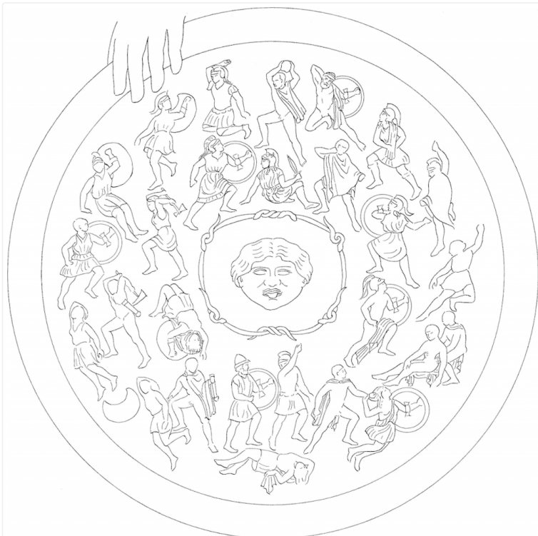
Reconstruction of the Amazonomachy scenes on the exterior of the shield of the Athena Parthenos. Plate 38 of E. B. Harrison, "The Composition of the Amazonomachy on the Shield of Athena Parthenos," Hesperia 35 (1966), pp. 107-133.

contact with the upper rim of her gigantic metal Shield. Both in the line drawing and in the color photograph, you get a good view of Athena's white fingers poised over the action of the battle that is ongoing below. And, if you look closely in both pictures, you can see on the lower right corner of Athena's Shield that striking detail from the Amazonomachy where the beautiful Amazon with the flowing hair, in her stop-motion choreography of death, is forever prevented from leaping forward and reclaiming her freedom from domination by men.