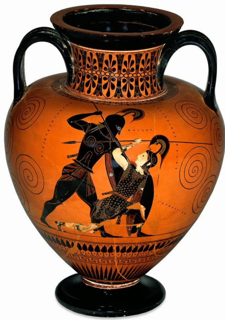
Achilles killing Penthesileia. Black-figure amphora, 530–525 BCE.