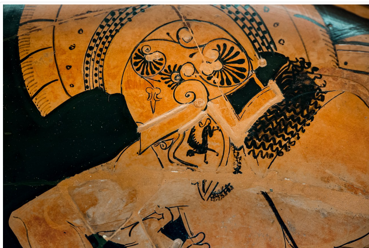
Close-up on the face of Achilles.