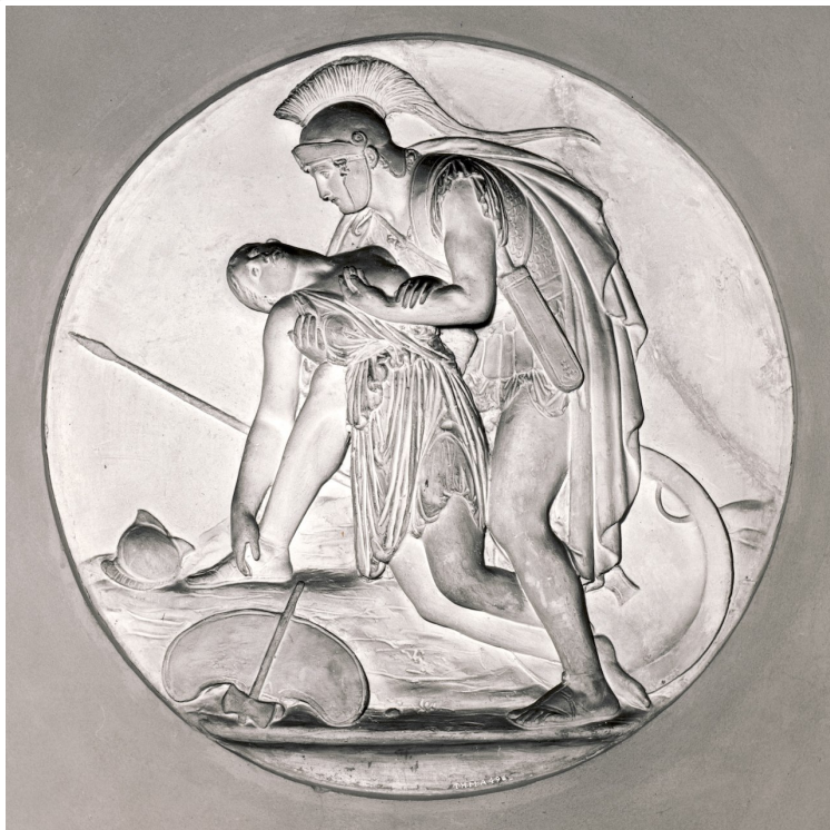
Achilles and Penthesileia. Plaster medallion (1837), by Bertel Thorvaldsen (Danish, 1770–1844).

§13. In closing, I epitomize what I originally said in my comments (Nagy 2018.01.12) about the death of the Amazon as pictured by Pheidias in his masterpiece of metalwork. To illustrate my epitome, I focus on two pictures. The first picture is a line drawing that reconstructs the world of images that had been metalworked by Pheidias into the convex surface of Athena's Shield. The second picture is a close-up color photograph showing the reconstructed Athena-with-Shield as housed in Nashville, Tennessee. Featured there on the surface of the Shield is the narrative of the Battle of Athenians and Amazons in all their metallic glory. I find it most moving, somehow, to see the ivory fingers of the goddess as they make