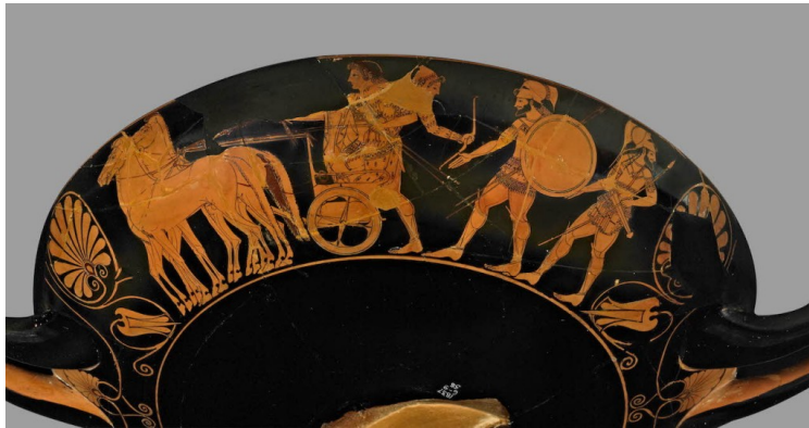
Abduction of Antiope by Theseus. Red-figure kylix (ca. 520–500 BCE).

I find it most significant that the tomb of Antiope the Amazon should be the very first thing to be seen by Pausanias as he enters the city of Athens. On the symbolism of Athenian myths about a primordial antagonism between Athens and the Amazons, I refer to my analysis in HC 4§§213–215, 4§224. According to one myth, this antagonism was precipitated by the abduction of Antiope, queen of the Amazons, by Theseus, king of Athens. Here are some ancient illustrations of this abduction: