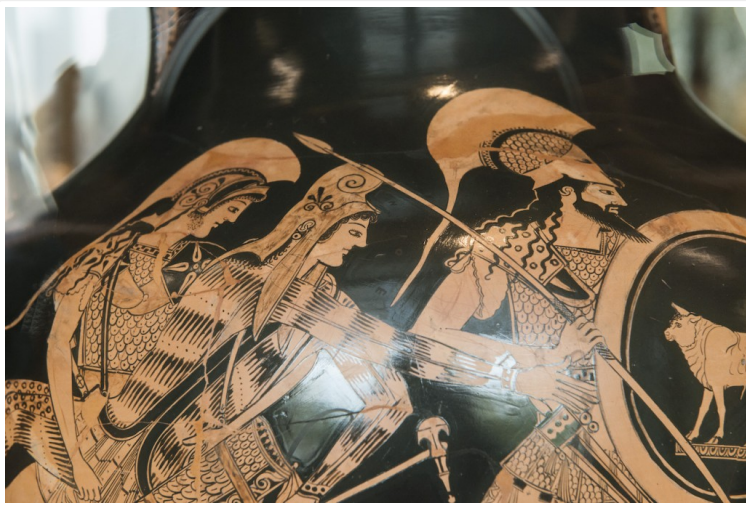
Close-up of the Myson vase.