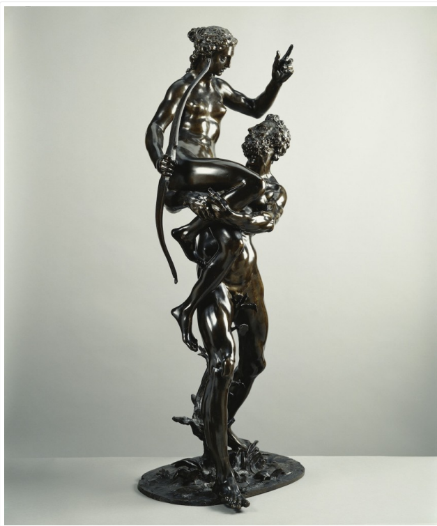
Abduction of Antiope by Theseus (c. 1600–1601). Adriaen de Vries (c. 1556–1626).

§4. The idea that Antiope then falls in love with Theseus as her abductor, as mentioned by Pausanias here at 1.2.1, is a topic that disturbs—and that needs further investigation. Relevant, I think, is what we read later on at 1.41.7 in the narrative of Pausanias, where he says that he saw in the city of Megara a mnēma ‘tomb’ of another Amazon, Hippolyte, who was sister of Antiope. Pausanias says that this tomb was linked with a myth about Hippolyte: how this hero became queen of the Amazons after her sister Antiope was abducted by Theseus, king of the Athenians, and how Hippolyte and her fellow Amazons then went to war against Athens to avenge the abduction. The outcome was a bitter defeat for the Amazons, and most of them perished in the war, but Hippolyte survived and sought refuge at Megara, where she died from her lupē . This word lupē as used by Pausanias at 1.41.7 can best be translated as the ‘pain’ of mourning.