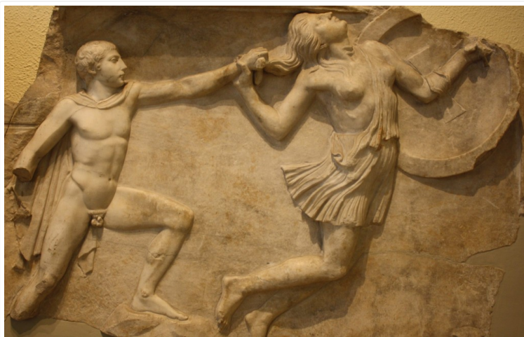
Amazonomachy: an Athenian pursuing an Amazon. 2nd c. CE. Image via .

§11. What we see here in the second picture, which zooms out from the first picture, is beautiful but disturbing. The picturing of the violence inflicted on the woman by the man offends our contemporary sensibilities, but, then again, the whole myth of the Amazonomachy is difficult in and of itself for us to understand.