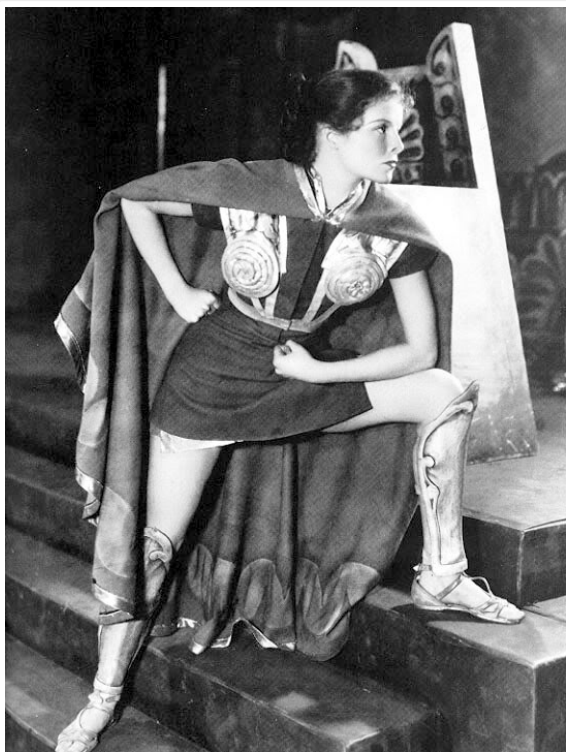
Katharine Hepburn in the 1932 Broadway production of The Warrior's Husband .