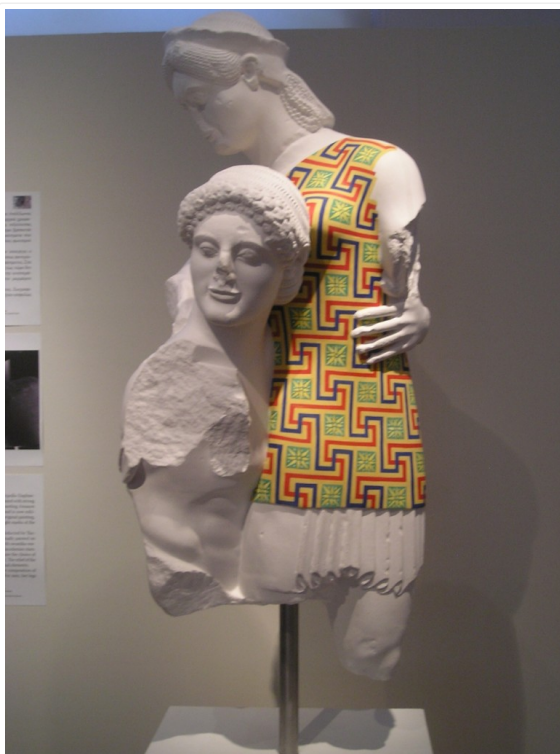
Abduction of Antiope by Theseus. Colorized cast reconstruction is by Ulrike Koch-Brinkmann and Vinzenz Brinkmann, originally created for the exhibition "Penelope rekonstruiert: Geschichte und Deutung einer Frauenfigur," Museum für Abgüsse Klassischer Bildwerke in Munich, 10 October to 15 December 2006. The original sculpture is from the pediment of the Temple of Apollo at Eretria, ca. 510 BCE, now in the Archaeological Museum of Eretria.