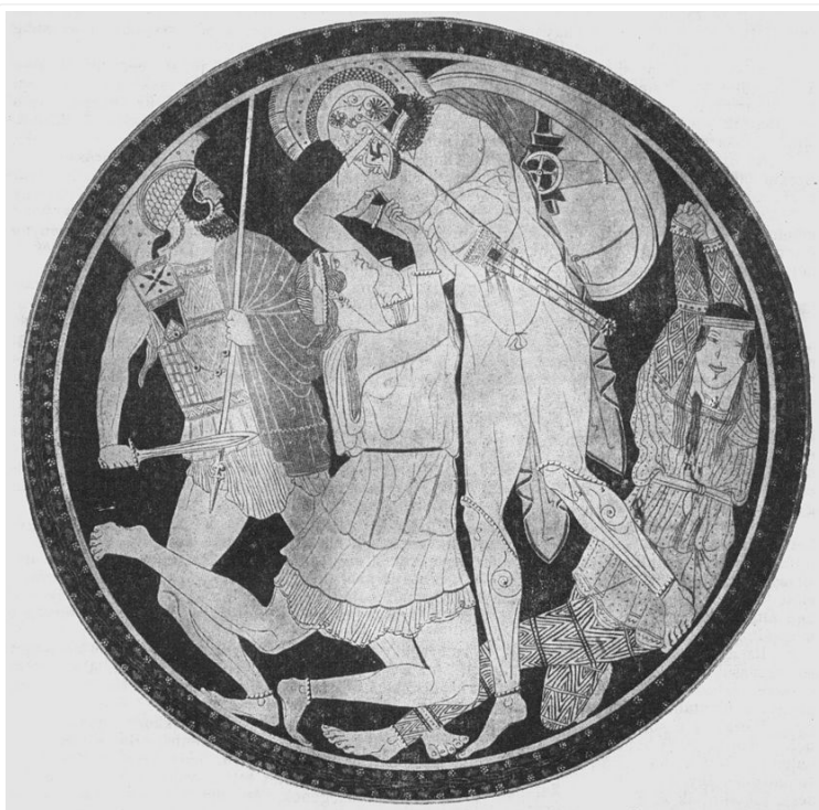
Line drawing of the painting on the kylix depicted in the photos above.