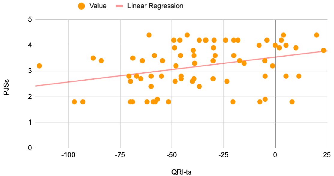
Figure 3. Quality of Relationship Index – Total Score (QRI-ts) and Perceived Job Stability Score (PJSs).

Figure 3 visualizes participants' QRI-ts and the PJSs of their occupations. It also displays the line fits those points through linear regression.