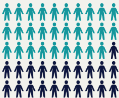
58% of high school students in LA are CTE concentrators. 1

How LA reports the program quality indicator: