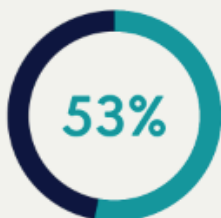
53% of secondary CTE participants in state are students of color 3

Based on LA's reporting definition, 30% of CTE concentrators contribute to this program quality indicator. 2