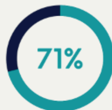
71% of students come from low socioeconomic backgrounds 5