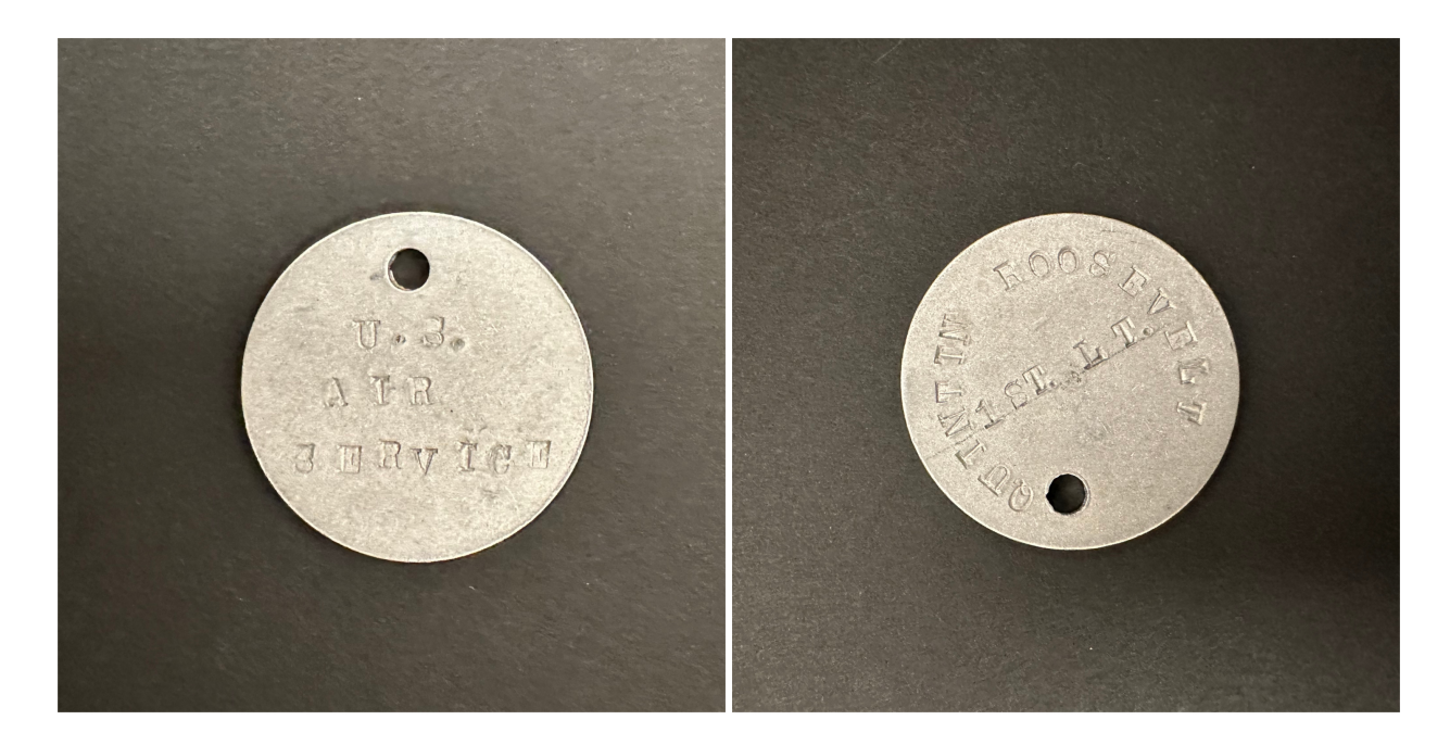
Figure 3. Quentin Roosevelt's dog tag, Houghton Library, Harvard University.