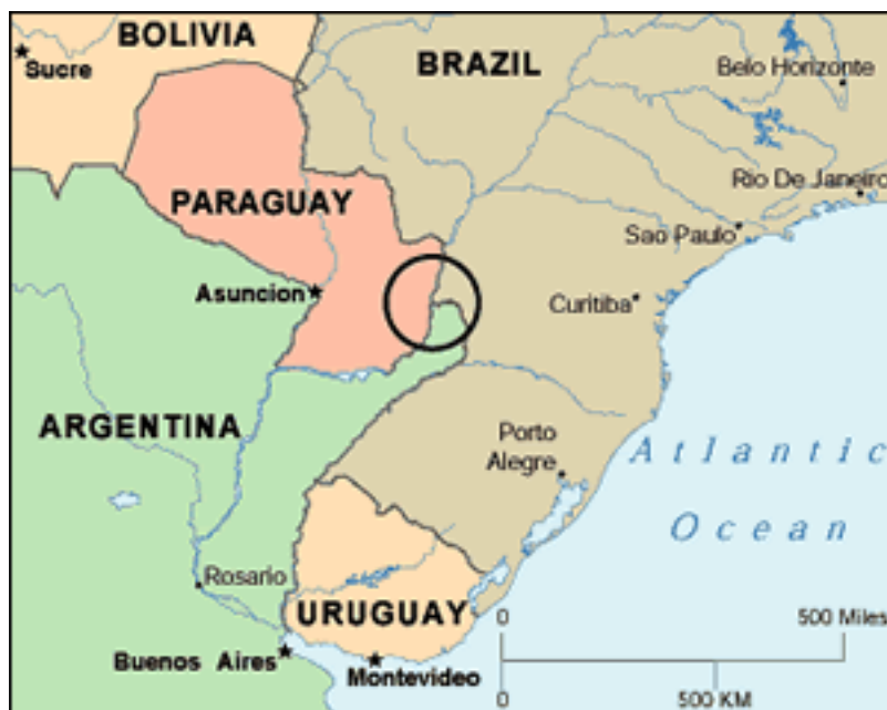
Figure 1: Map of Tri-Border Area. 20

The TBA, South America’s busiest contraband and smuggling center, is home to a large, active Arab and Muslim community consisting of a Shi’a majority a Sunni minority, and a small population of Christians who emigrated from Lebanon, Syria, Egypt, and the Palestinian Territories [starting] about [6]0 years ago. 21