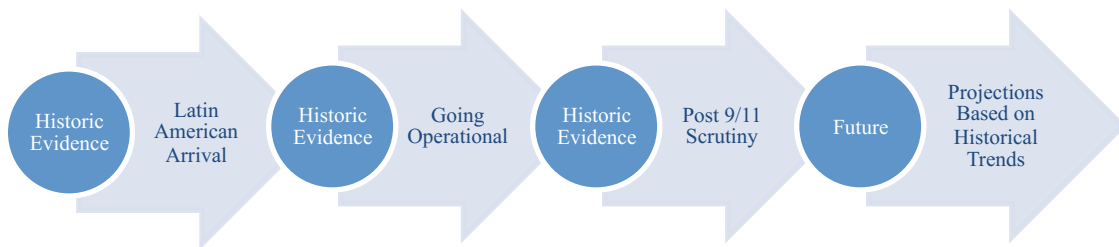
Figure 3: Theoretical Illustration of the Evolution of the nature of Hezbollah's presence in Latin America and informed future projections.

A theoretical illustration of the cumulative history of Hezbollah's known activities, sanctuaries, and partnerships is demonstrated in Figure 3. The concept demonstrated is meant to reveal how this study can answer the primary question of this study and inform policy makers of Hezbollah's history in Latin America, allowing them to make inferences as to the future nature of Hezbollah's presence in the region.