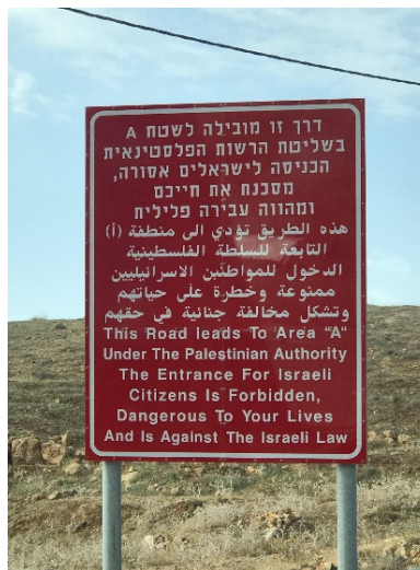
Figure 3. Sign at the entrance of Area “A”

Today, in 2017, Palestinians in the West Bank and Gaza still need special authorization in order to travel to Israel. The Israeli government actively discourages Israeli Jews from visiting the West Bank, and Gaza almost never grants permission to Israeli Jews to visit. Palestinians living in Israel are only allowed into Gaza under unusual circumstances (Spangler, 2015, p. 120). At the entrance to Area “A,” a sign is posted that prohibits Israeli Citizens from entering the territory. It indicates that entering the territory can endanger their lives.