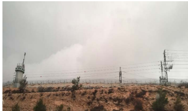
Figure 2. Part of the wall built in 2003 that divides Israel and the West Bank

In June of 2002, the construction of a separation wall began between the Israel and Palestine borders that was led by Israel's Defense Minister, Binyamin Ben-Eliezer. It was built to be 650 kilometers long, and ran into the West Bank on Palestine territory to allow more Jewish settlements to build homes. With the building of the wall, many Palestinians lost access to water, roads, and homes, as well as half of the land of the West Bank (Lagerquist, 2004, p. 6). The wall came into effect in 2003 and divided the land into four parts A, B, and C, and D. In the beginning, the Israeli government claimed that the fence was only temporary, however after some time, it became clear that the wall was there to stay, and is still in effect today (Lagerquist, 2004, p. 8).