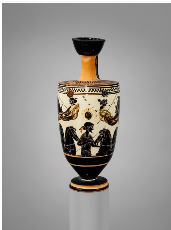
As the chariot of the Sun ascends in the middle, Dawn and Night ride away in their chariots to either side, Dawn to the right of the viewer and Night to the left. Archaic black-figure, white-ground vase, ca. 500 BCE, attributed to the Sappho Painter.

The debt owed by old students to their still older teachers who are by now long gone can become a mystical kind of thing. That is what I sense as I now think back on ideas I first learned from Roman Jakobson in the early 1960s. Today I still use many of the same ideas in projects having to do with my research or with my teaching or with both—or even in casual conversation. And I often find myself wondering: are these ideas, as I remember them, really the same as they once had been? If they were really the same, how come I feel I need to re-learn each of these ideas each time I try to use them again? In this essay, I focus on one such idea, which can be summed up in two words that seem at first rather forbidding when you first see them combined with each other: these two words are markedness theory. For me the idea behind the theory comes alive every time I try to use it, and it comes to life precisely because I keep on having to re-learn it.