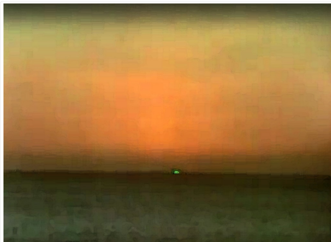
After Le Rayon Vert , directed by Éric Rohmer (1986): the green ray at sunset.