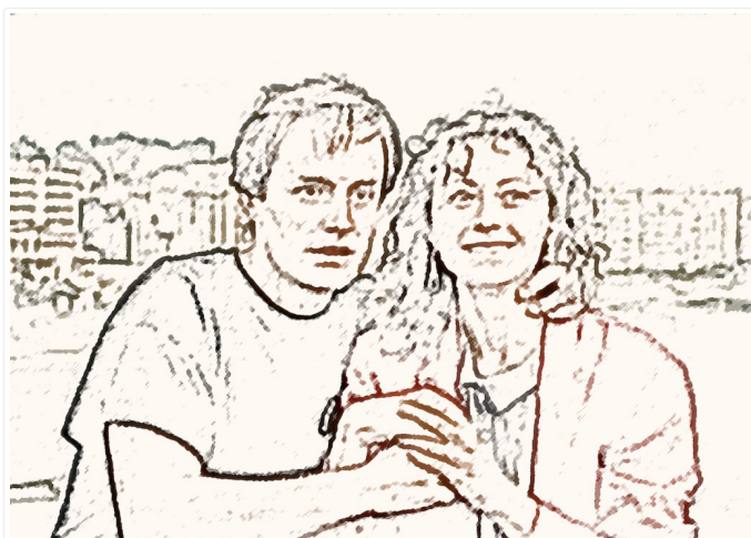
After Le Rayon Vert , directed by Éric Rohmer (1986): Jacques and Delphine before the green ray.

§0. It is summer. A young woman and a young man are sitting side by side at a beachfront, looking out toward the vast sea that is facing them. They aim their gaze westward, viewing what seems like an infinite stretch of water that reaches all the way to the darkening horizon where the sea finally meets an infinite sky. As they watch the sun sink slowly into the sea, the young woman starts weeping. Then, suddenly, at the very moment when the glowing orb finally goes under, it gives off a subtle green flash. This is the green ray, which is a literal translation of the French words le rayon vert . The moment I am describing takes place in a film directed by Éric Rohmer , which actually bears the title Le Rayon Vert . It originally appeared in 1986. But Le Rayon-Vert is also the title of a romantic novel by Jules Verne, which appeared over a century earlier, in 1882. The novel was in fact the original inspiration for the film, though the stories differ radically. In the film, the story ends on a seemingly happy note: once she sees the green ray, the young woman who was weeping a moment earlier is now smiling as she cries out: oui ! But the happiness of this moment marked by the outcry of 'yes!' is not what interests me the most in this film: rather, I will highlight the earlier moment of weeping.