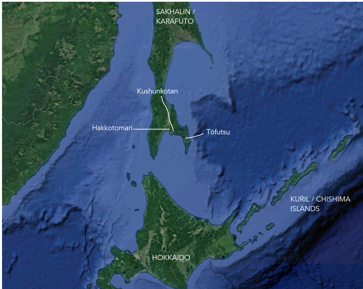
Figure 2: Map of the Japan-Russia frontier. Based on Akizuki, Nichiro kankei to Saharin tō , cover page.

In what Akizuki depicts as strategic moves to crowd the Japanese out of Sakhalin militarily, in 1869 Russian forces moved west and began constructing a base at Hakkotomari, an Ainu burial site immediately adjacent to the main Japanese settlement and economic hub of