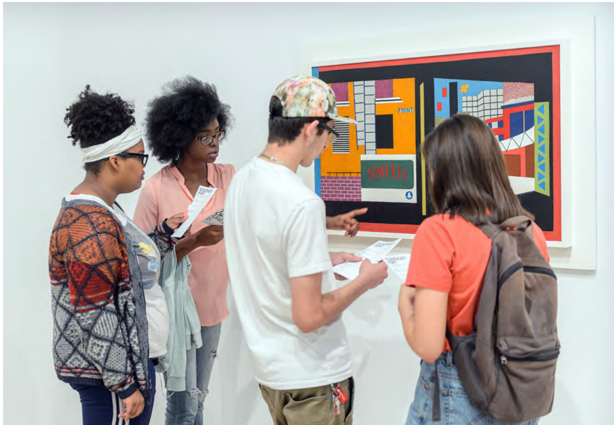
Figure 5: Room to Rise image of teens participating in the program, Whitney Museum of American Art , www.whitney.org/Education/Teens/RoomToRise

diversity aspirations of the participating art museums, and what short-term and long-term benefits impact the institution. Below you can see four teens from diverse backgrounds and gender examining a painting at the Whitney Museum of American Art (see fig. 5).