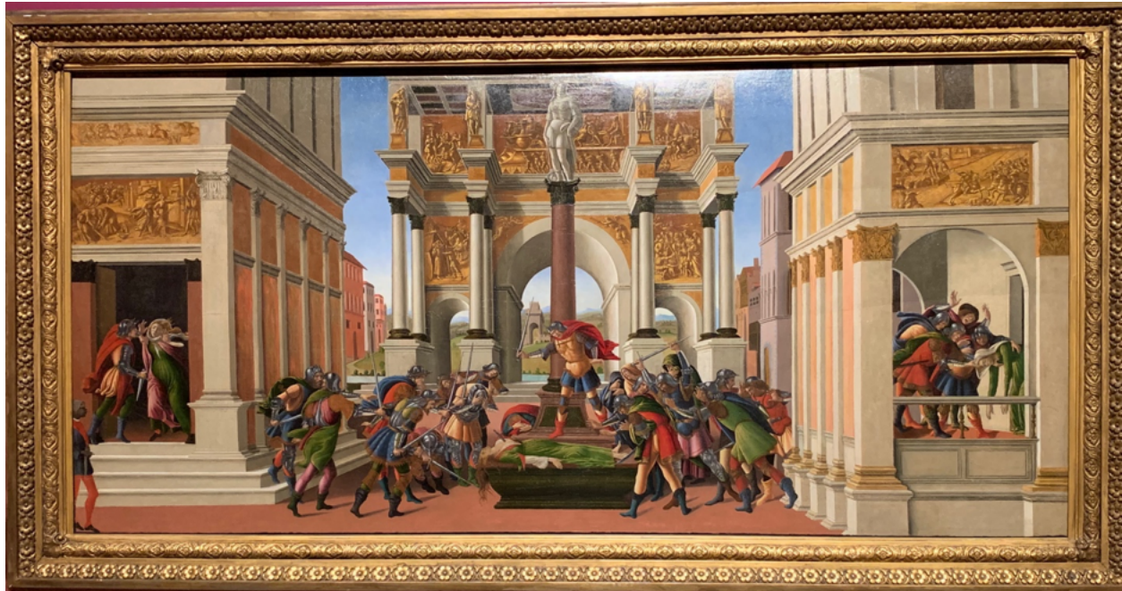
Figure 7: Sandro Botticelli. The Story of Lucretia . 1500

Isabella Stewart Gardner Museum, Taken 8 Mar 2019, by Charles Moore