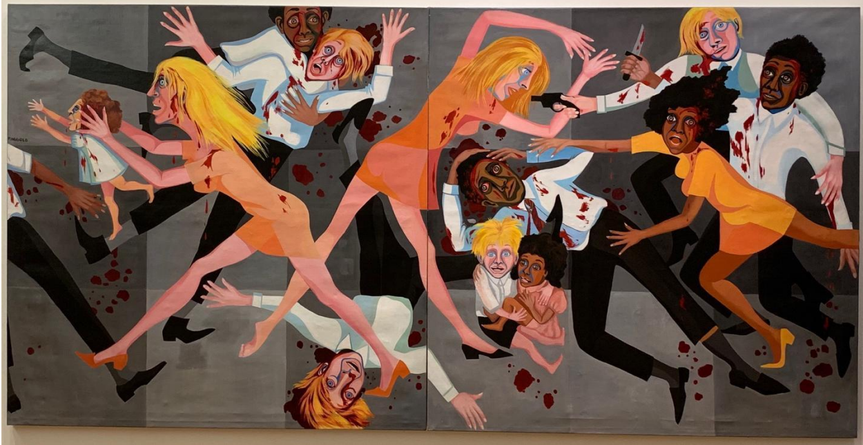
Figure 1: Faith Ringgold, The American People Series #20: Die , 1967, Museum of Modern Art

This painting depicts one of the many ways that even the black intellectuals have had their voices muted.