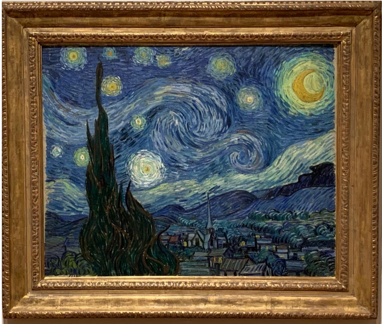
Figure 3: Vincent Van Gogh. Starry Nights . Museum of Modern Art, New York