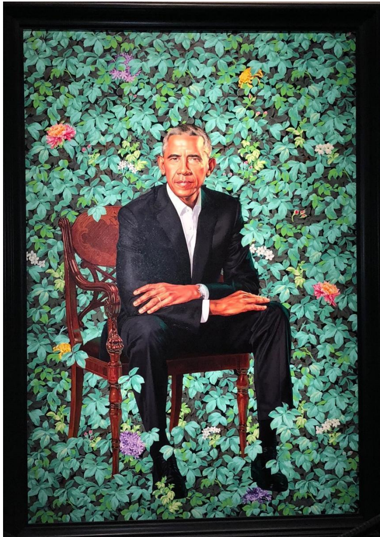
Figure 4: Kehinde Wiley. President Barack Obama . National Portrait Gallery, Washington D.C.

questions, can be used repeatedly to build a student's critical thinking skills and ultimately has the potential to enhance their social capital.