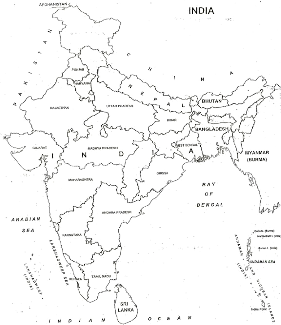
Figure 1: Major States of India