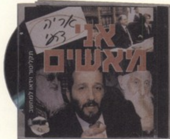
Videodisc (above) and videotape (below right) of "Ani ma'ashim" ("I accuse"), which argues for the exoneration of Shas leader Aryeh Deri.

The poster is an important communications tool in Israel, and many in our holdings do not exist, in original form, outside Harvard Yard. Every election produces a large number of posters. Illustrated on the following page, from the May 1999 election, is a poster issued by Shas, the religious party that is a major partner in the governing coalition. The poster—with the legend "To restore the crown to its glory of old"—features pictures of Rabbi Ovadia Yosef, the spiritual leader of Shas; of Rabbi Yitshak Kaduri, an influential mystic; and of Aryeh Deri, the political leader of Shas who was convicted of fraud and accepting bribes in April 1999.