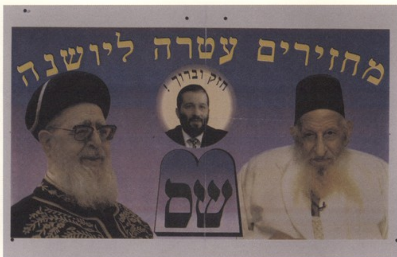
"Restoring the crown to its glory of old"—a poster from the May 1999 election. Original 47" × 29.25".

and an extensive collection of Israeli radio programs from Kol Yisrael and others, including most of the archive of Aruts Sheva (Channel Seven), the radio station of the nationalist religious camp. To all this there has recently been added a substantial collection of photographs (print and digital) documenting Israeli theatre, opera, and dance.