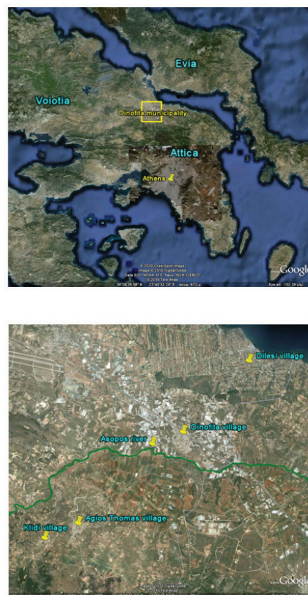
Figure 1 Map of the Oinofita municipality (study area) in Greece. Panel A: Oinofita municipality lies at the border of the Voiotia with the Attica prefecture. Panel B: Oinofita municipality is comprised of four villages: Klidi, Agios Thomas, Oinofita and Dilesi. The high industrial concentration near Asopos river can also be observed.

Initial concerns were raised after Oinofita area citizens complained about the discoloration and turbidity of their