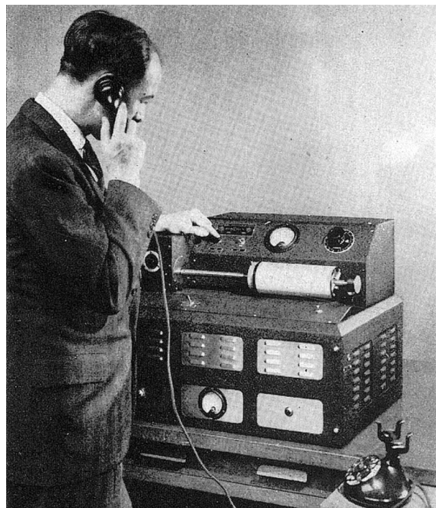
Photos of telegraphic image transfer, from The Complete Photographer (1943).