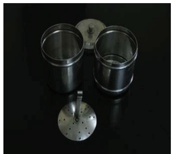
Figure 2 South Indian metal 'filter' coffee instrument.

single cycle. A number of cycles may be performed depending on taste. The South Indian 'filter' coffee method consists of an upper cup which has a pierced bottom, a pierced pressing disc with a central stem handle and a covering lid. This cup nests into the top of another round bottom cup, leaving enough room below