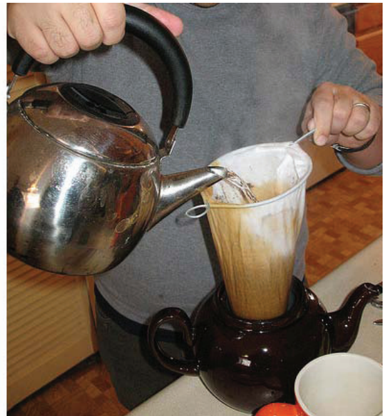
Figure 1 Traditional 'Sock' Method used in Singapore and Malaysia.

The traditional Singaporean and Malaysian 'sock' method involves the coffee beans being wok-roasted to a dark black brown with sugar, margarine and occasionally pineapple skin and corn and subsequently ground, brewed and filtered through the 'sock' into watering can-sized pots [23]. Nowadays, hot water is poured through the 'sock' into a receiving container and then pouring that fluid through the 'sock' again to constitute a