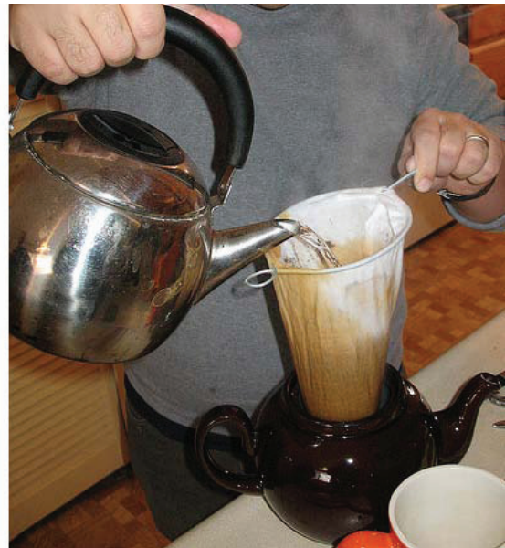
Figure 1 Traditional 'Sock' Method used in Singapore and Malaysia.

The traditional Singaporean and Malaysian 'sock' method involves the coffee beans being wok-roasted to a dark black brown with sugar, margarine and occasionally pineapple skin and corn and subsequently ground, brewed and filtered through the 'sock' into watering can-sized pots [23]. Nowadays, hot water is poured through the 'sock' into a receiving container and then pouring that fluid through the 'sock' again to constitute a