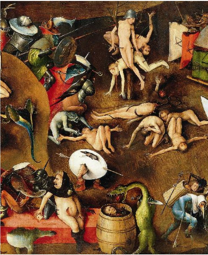
Figure 1. This detail from The Last Judgment by Hieronymus Bosch (1453-1516) illustrates the artist's apocalyptic vision of some of the worst that humans can think, say, or do.