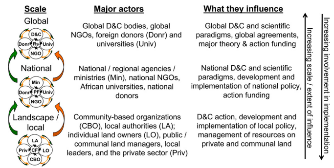
Fig. 2. Roles of the researchers, policy facilitators, and community facilitators in the spanning of boundaries among different actors and what those actors influenced at different scales. D&C, development and conservation; Rs, researchers; PF, policy facilitator; CF, community facilitator.

We then constructed a boundary-spanning team of members, each of whom had a responsibility to span boundaries between institutions at different, nested scales (Fig. 2). At the global level, we asked each of the international scientists on the core team to connect the team’s work with international conservation and development organizations and teams [like the United Nations