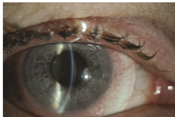
Figure 1. A Prosthetic Replacement of the Ocular Surface Ecosystem (PROSE) lens fitted over the eye of a patient with severe dry eye due to chronic graft versus host disease.