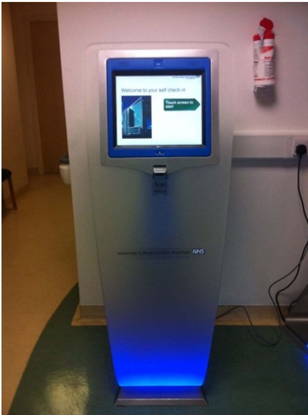
Figure 1 Self-service check-in kiosk.

relation to patients managing their own long-term conditions, for example, diabetes, and anti-coagulant medication: