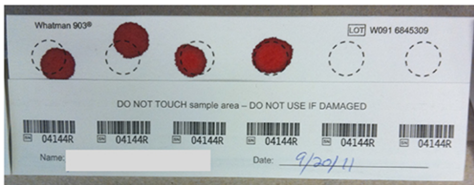
Figure 1. Dried blood spot sample. A collection card is shown with four, valid collected spots in the process of drying. Click here to view larger image.