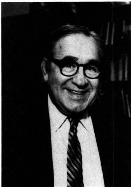
Robert W. Fogel