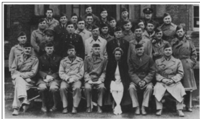
Fig 1. The Fifth General Hospital in Belfast, 1942 4

The U.S. Army 5 th General Hospital 1,2 was activated on 3 January 1942 at Fort Bragg, North Carolina 3 weeks after Germany declared war on the United States. Five hundred patient beds were to be sited at “Musgrave Park in the environs of Belfast”. The former boys’ reformatory was occupied at that time by the 31 st General Hospital of the British Army.