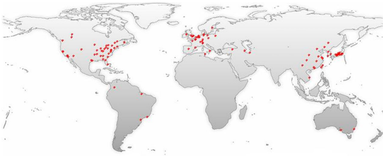
Fig. 2 A world map with the global distribution of macrophage- and SCI-related publications based on the analysis of their geolocal data. This figure was generated through GoPubMed (website: http://www.gopubmed.com ). GoPubMed is a knowledge-based search engine for biomedical texts. The technologies used in GoPubMed are generic and can in general be applied to any kind of texts and any kind of knowledge bases. The system was developed at the Technische Universität Dresden by Michael Schroeder and his team at Transinsight. Creation steps for this timeline: import search items to the Search Box at the home page, and then click 'Statistics' and download related statistical charts including the timeline and map.

and Samuel showed that microglia-derived macrophages contact damaged axons early (24 hrs) after SCI and are the main type of macrophage to contain phagocytic material at day 3 [15]. Thereafter, infiltrating bone marrow-derived macrophages become the predominant cells in contact with degenerating axons and contain more phagocytic materials that persist for up to 42 days, which is different from microglia-derived macrophages [15]. Furthermore, after phagocytosis of myelin in vitro , bone marrow-derived macrophages are much more susceptible to apoptotic and necrotic cell death than microglia-derived macrophages, which has been observed in vivo with apoptotic TUNEL-positive cells of bone marrow-derived