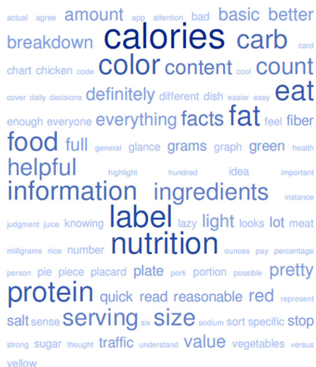
Figure 3 A word cloud representation of student descriptions in focus groups of an ideal nutrition label highlights words of high frequency.

me' to avoid eating tasty unhealthy food but agreed with other students that 'an internal thing like the dots [TLLs]' could make them 'think twice' and 'avoid red' items (Table 3, Theme 3a).